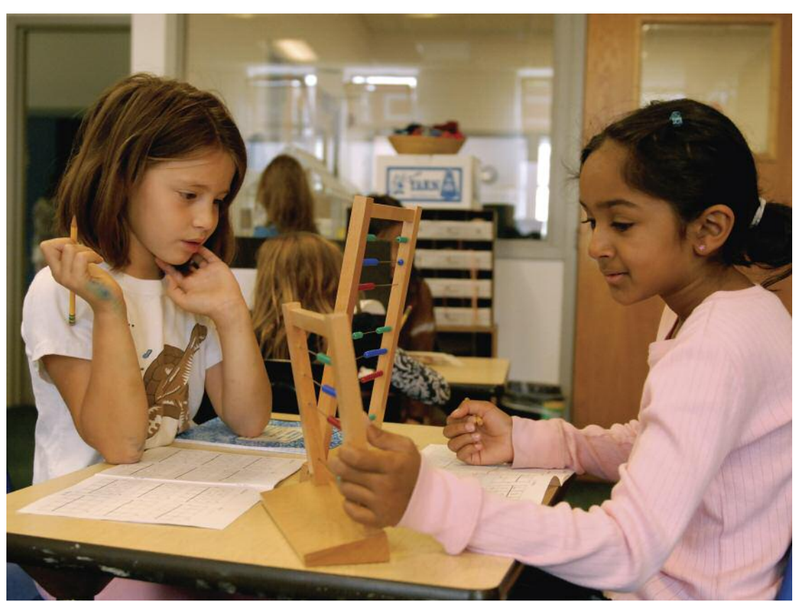
Solving problems with the abacus